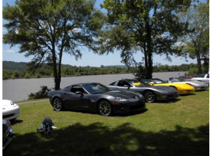
Lined up by the river.