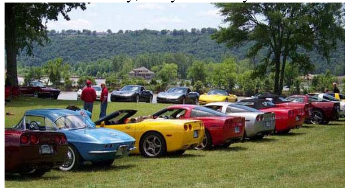
Surrounded by corvettes.