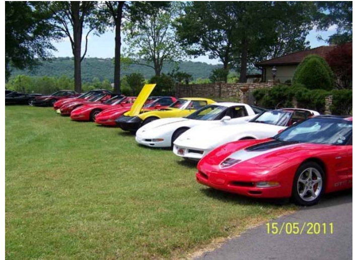
Lined up and looking fine.