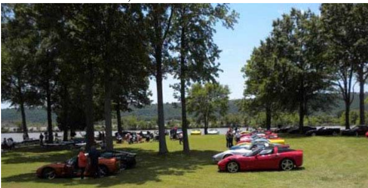
Vettes on the River.