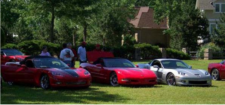
Bet they are talking about corvettes.