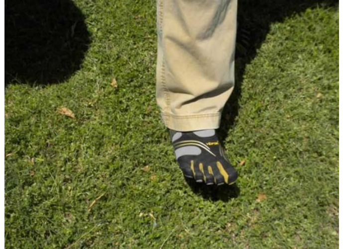
Someone's fancy footwear.