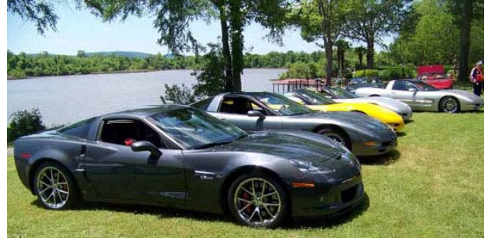
Vettes and the Arkansas River