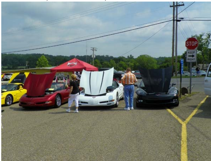
Checking out the vettes