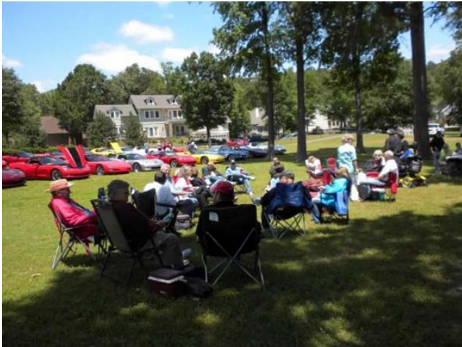
Enjoying the people & conversation.