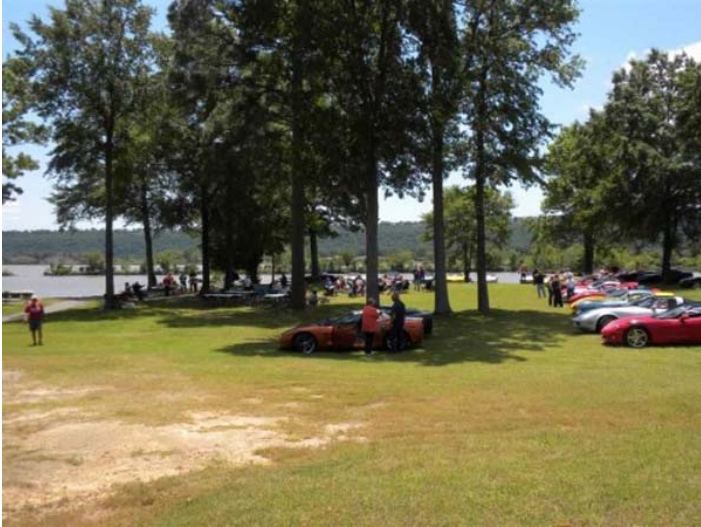
Check out that view.

Sunday, May 11 CACC Club Picnic – Maumelle Park – Many of the club members gathered on the river to have some fun at our annual after the show picnic.