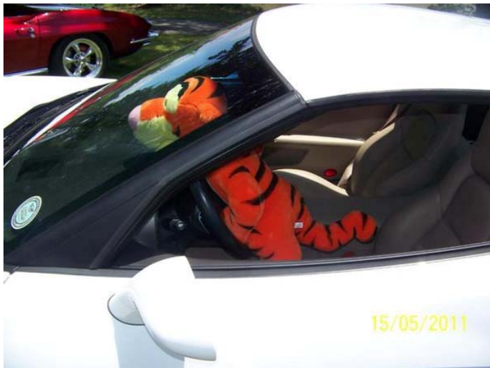
Who's driving Larry's vette?