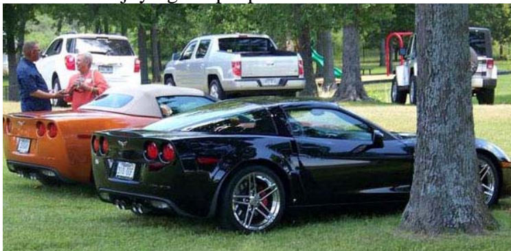
How close is that tree?