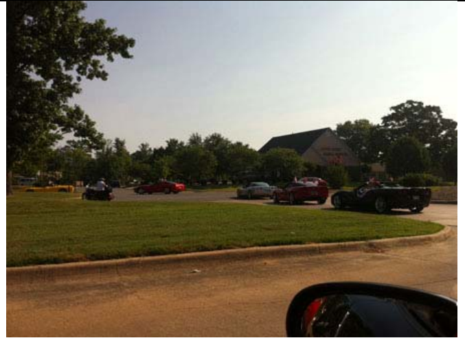
Leaving the Post Office parking lot