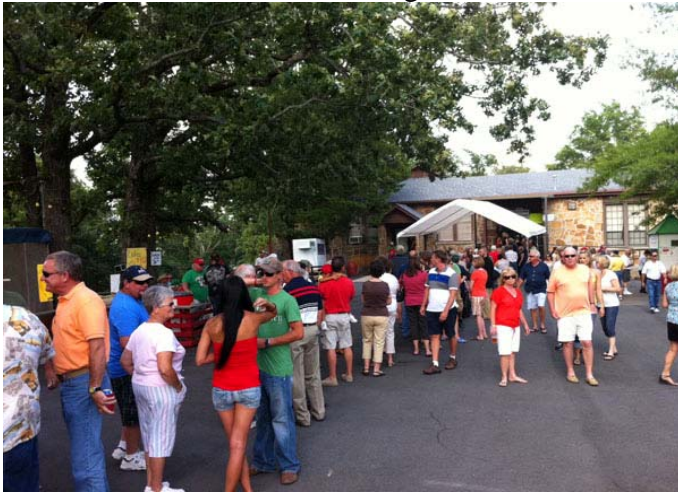
Waiting in line