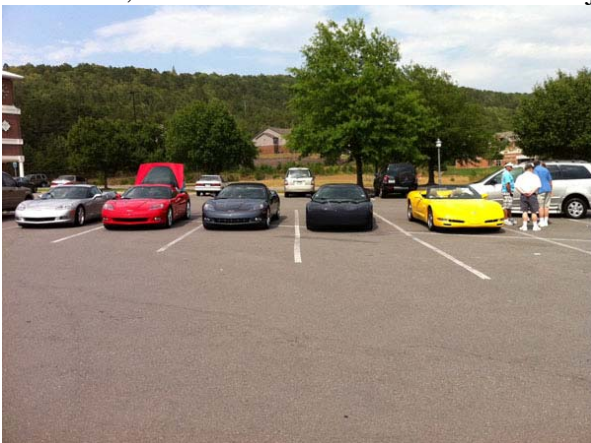
Meeting at Kroger parking lot on Hwy 10

Catholic Point Festival - Saturday, June 18 - another well attended event where you got to run some great corvette roads, dine on some fantastic food and enjoy the company of other corvette enthusiast.