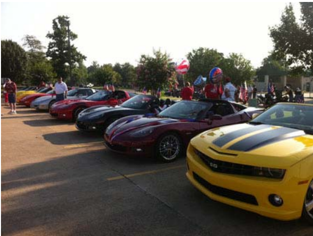
Good looking vettes & camaro