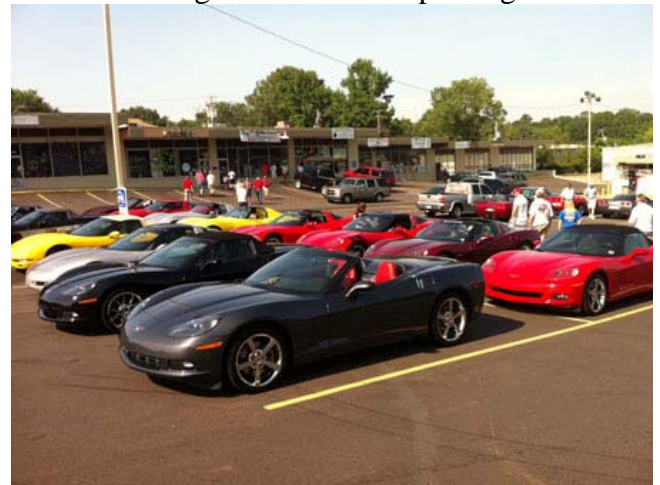
Parade is over, time for breakfast

Catholic Point Festival - Saturday, June 18 - another well attended event where you got to run some great corvette roads, dine on some fantastic food and enjoy the company of other corvette enthusiast.