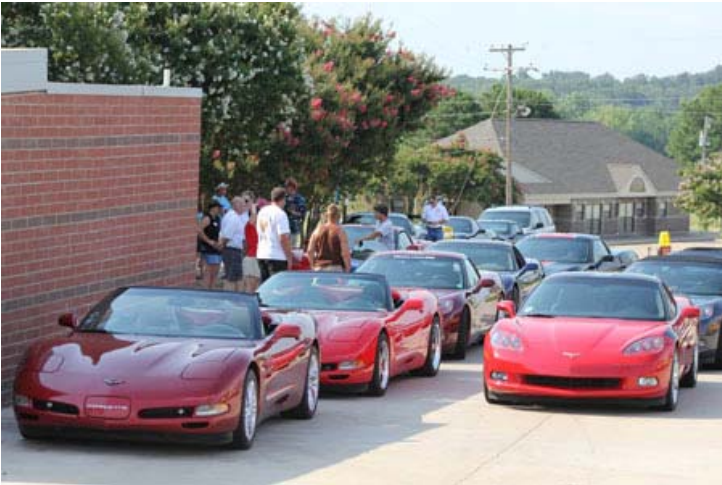
Pit stop at Morrilton