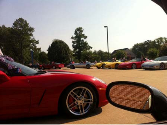
Lined up ready to go