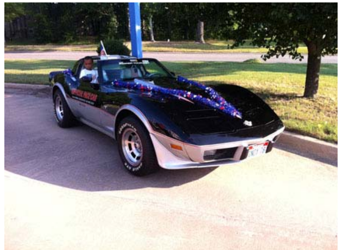
Roy's 1978 Pace Car