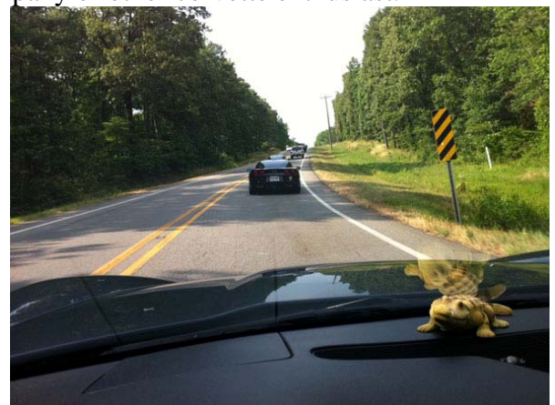
Heading to Opello to meet other club members