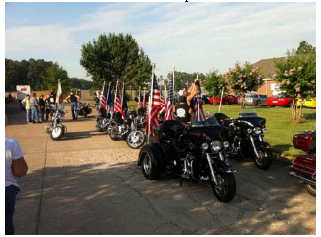
Motorcycle's have arrived