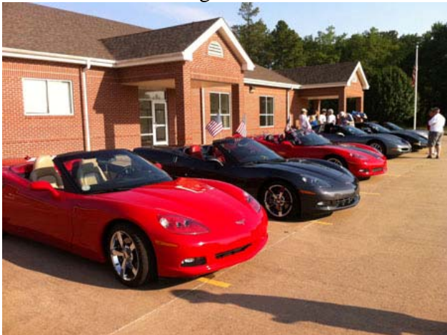
Ready and waiting