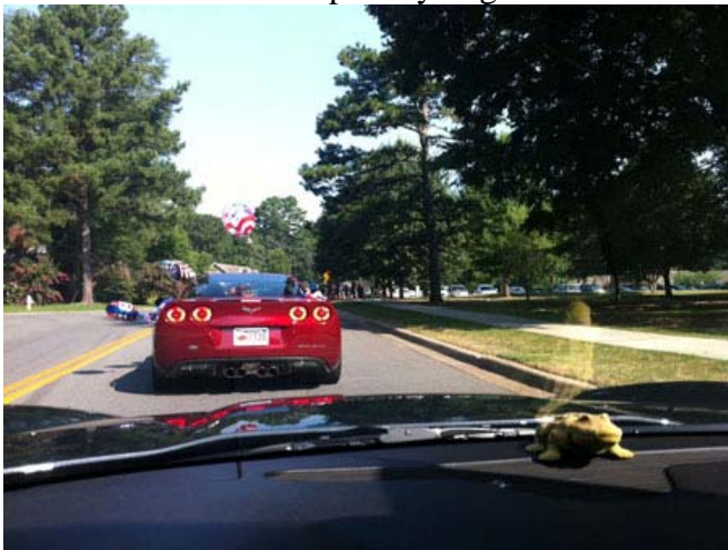
Down the road they go Pete's vette in front of Tommy