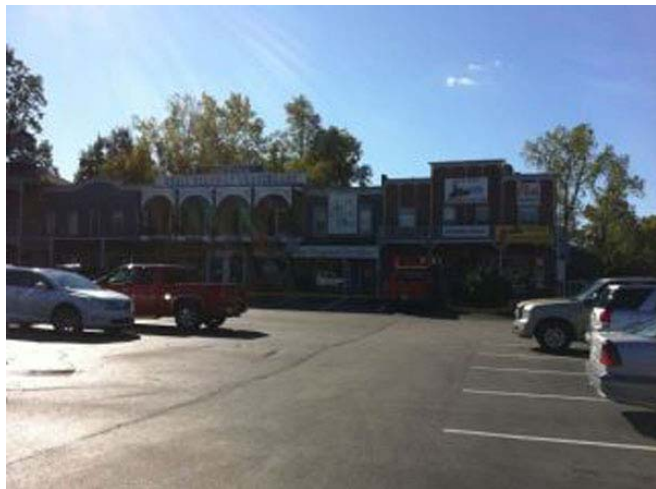
Casey Jones Village lunch break in Jackson, TN.

Vettes in the Smokies – October 20-23, 2011 – 13 club members set out to slay the dragon and tame several curved and hilly highways in the Smokey Mountains and they returned happy and successful. Below are some pictures to attest to these facts, there will be more pictures forthcoming: