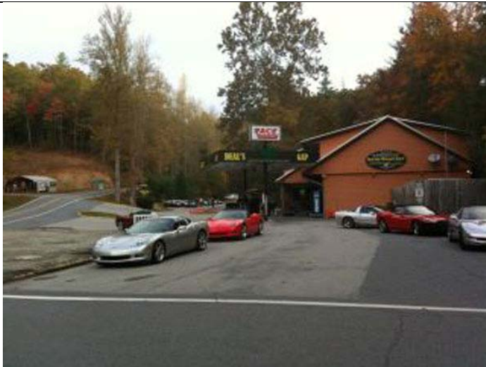
Group at Deal's Gap home of the dragon.