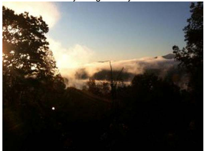
Smokey Mountains – beautiful.