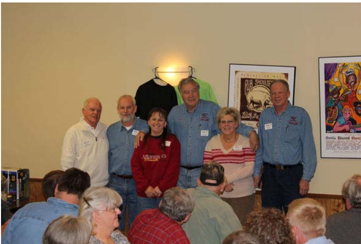
2012 newly elected officers.