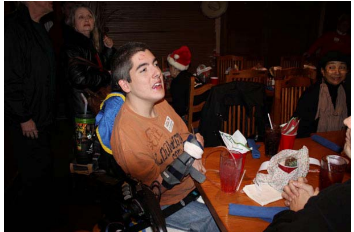
CW – CACC Ambassador