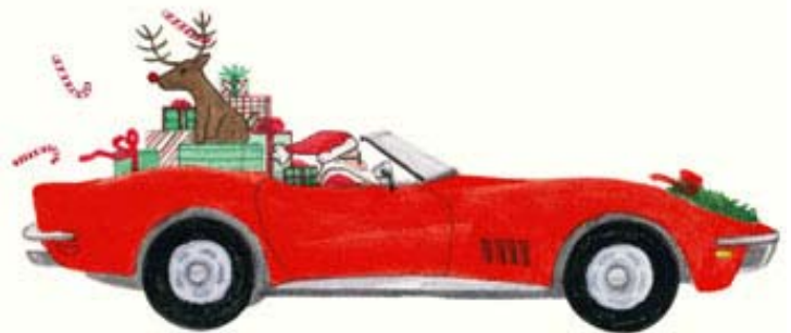
Santa is bringing your Christmas present in his jolly red corvette.