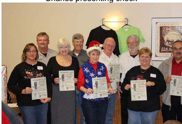
2011 Dragon Slayers