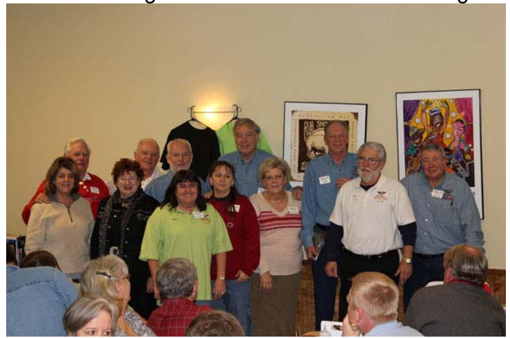
Most of the 2011 & 2012 officers.