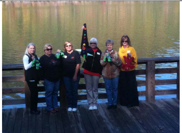
Lady Dragon Slayers.