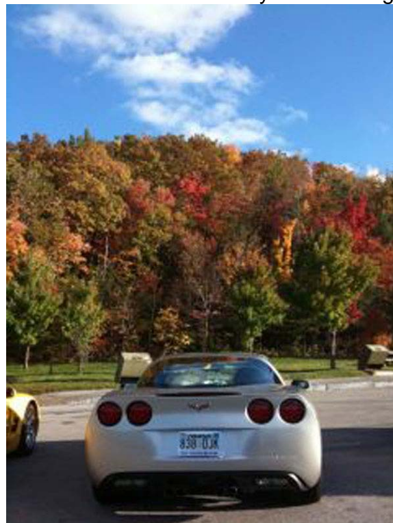
Great rear-end in the Smokies.

Casey Jones Village in Jackson, TN was the first day's lunch stop, the Old Country Store has a very good buffet with a large selection of food. There are other shops and the Casey Jones Museum there.