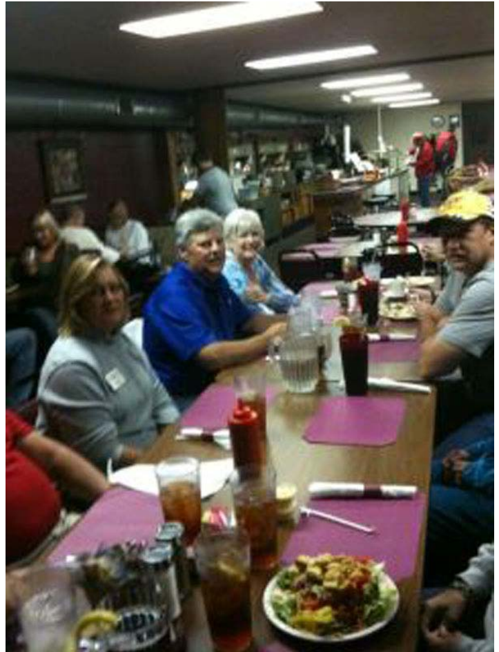
Stopped at Lynn's Place for a bite to eat.