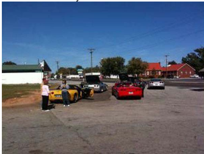
Pit stop in Westminster, SC.