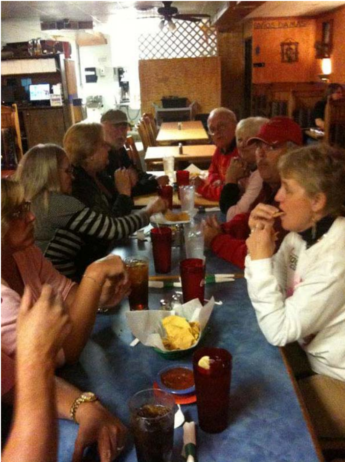
Mexican dinner at Pacifico's.