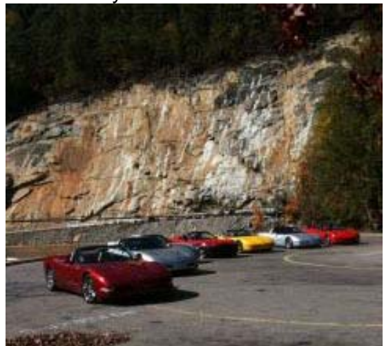
Somewhere in the Smokey Mountains.