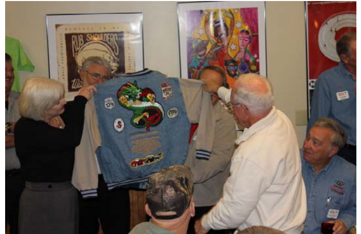
2011 Dragon Slayer presenting Don a jacket.