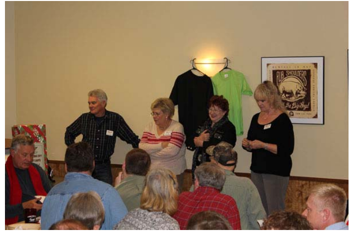
50/50 pot winners.