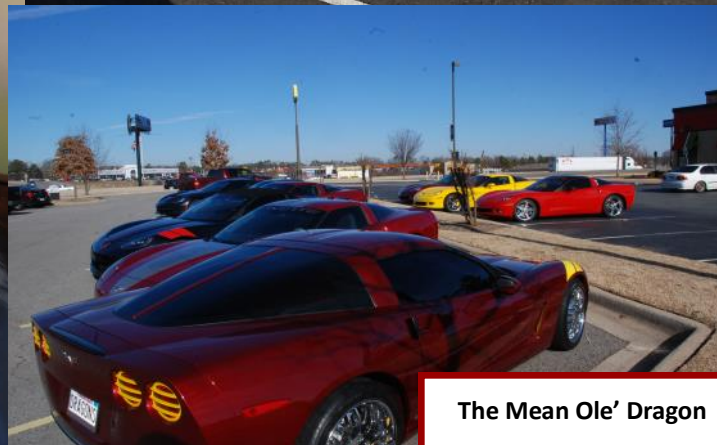
The Mean Ole' Dragon