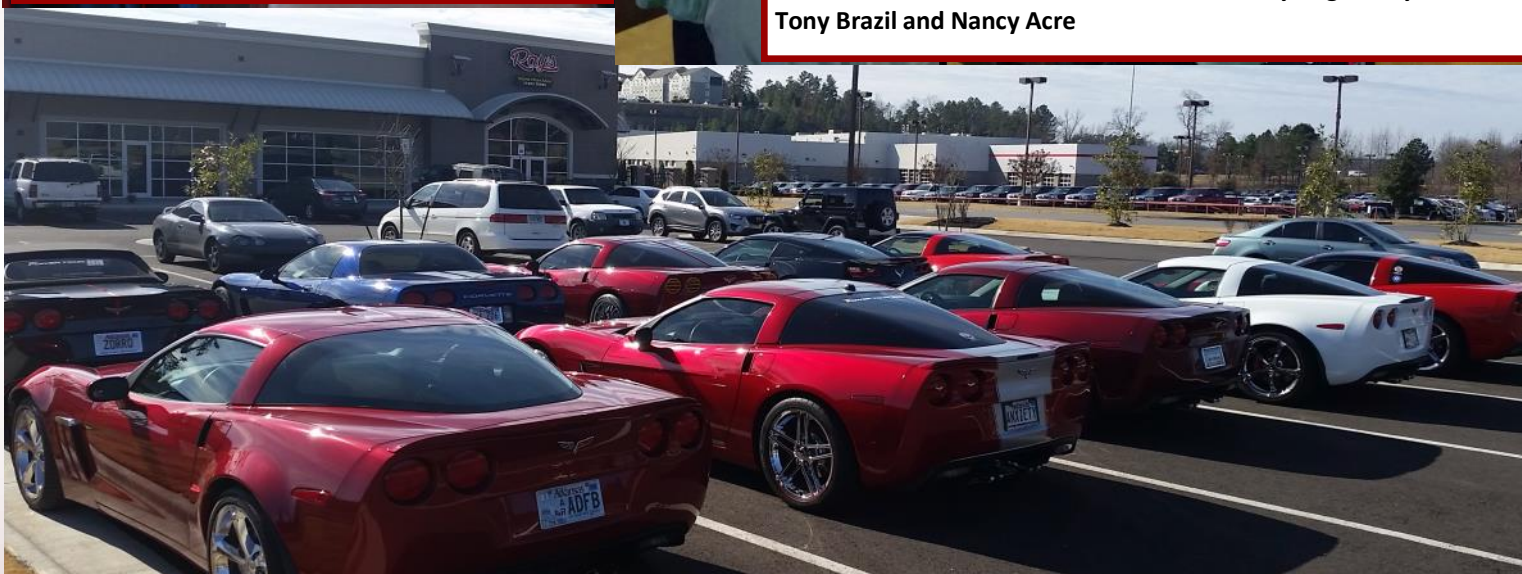
CACC vettes resting while they can.